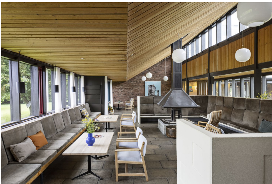
Kulturhotellet Højhuset

This special award goes to the "sustainability pioneer" Scandic Hotels